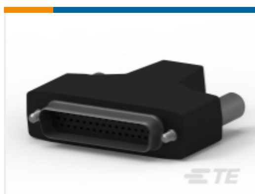
TE Part # 1658680-1 KIT,HDP-22,ENCLSUR,PLUG,SIZE 3