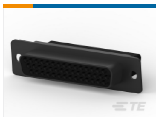
TE Part # CAT-038-DCRSS223 D-Sub Crimp Recpt Signal 44 Posn, Socket Size 22, Shell Size 3